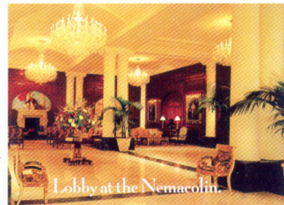
Lobby at the Nemacolin